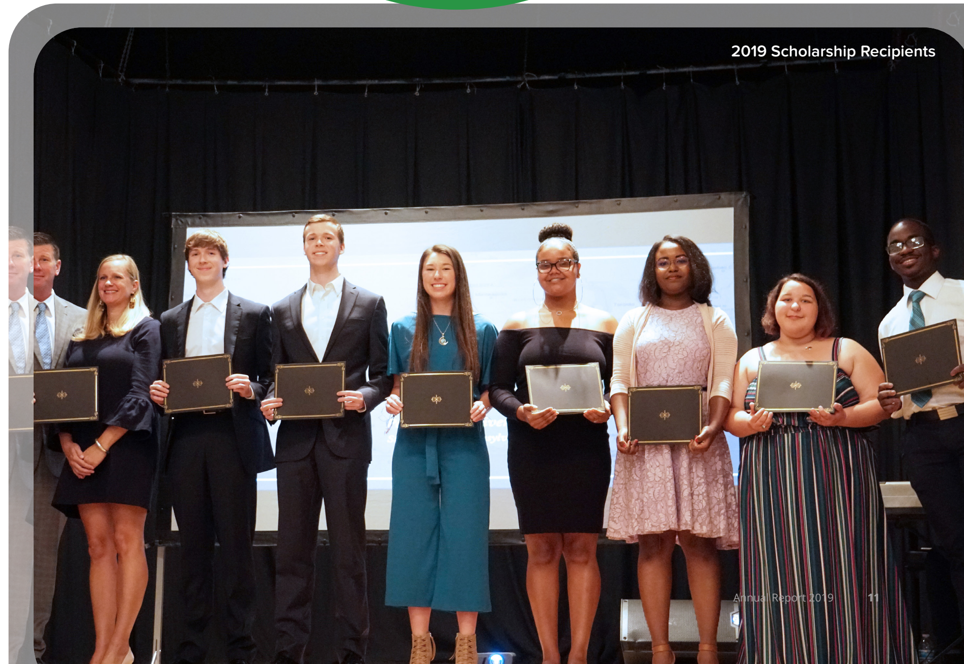
2019 Scholarship Recipients