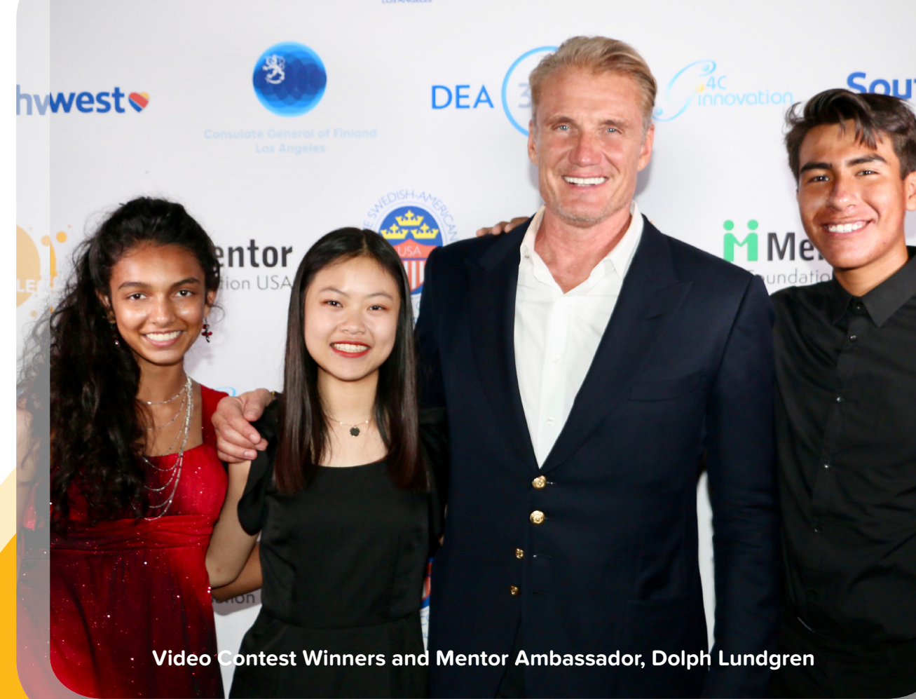
Video Contest Winners and Mentor Ambassador, Dolph Lundgren